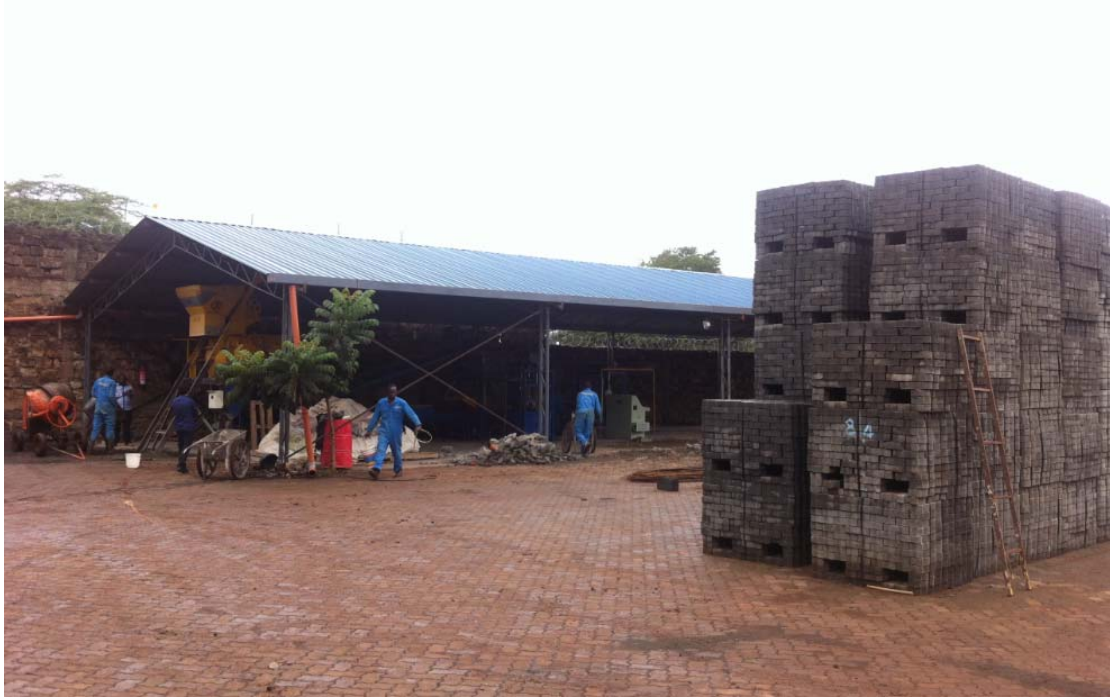
The third machine is being manufacturing underway: